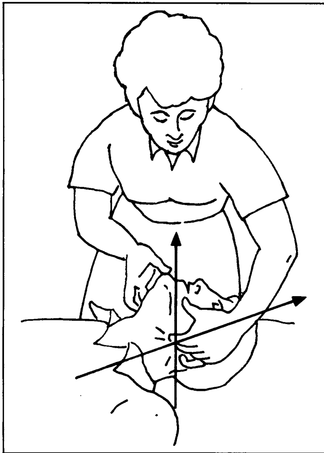
Fig. 1A: Jaw-thrust maneuver for maintaining airway patency.

ic evaluation alone, since in up to 67% of children with such an injury no radiographic abnormality is demonstrated. 21 However, they usually have trans-