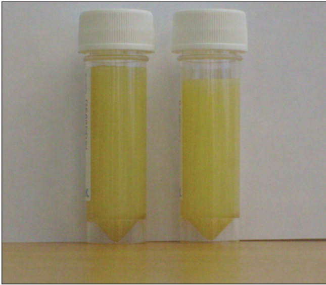
Figure 2: Milky off-white to yellow pleural aspirate.

The answer is (e) chylothorax. Milky white pleural fluid is a classic finding (although appearance may vary) in chylothorax or pseudochylothorax, a condition in which a chronic exudative effusion leads to the accumulation of cholesterol in the pleural fluid. This finding directs the physician to perform specific tests on the fluid to reveal the diagnosis. The distinctive appearance of the fluid is helpful in directing suspicion away from a complicated parapneumonic effusion, which is often associated with yellow turbid pleural fluid.