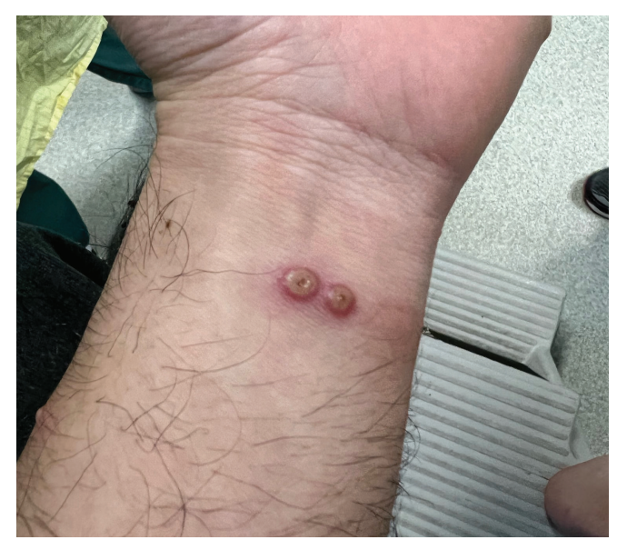
Figure 2: Photograph of the flexor surface of the left wrist of a 33-year-old man with monkeypox showing two 10 mm pustular lesions with central umbilication, captured on day 7 following the emergence of the lesions (illness day 10)