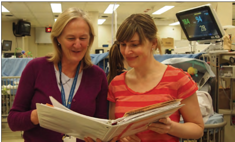
Figure 2: In the care-by-parent model, parents are provided with education, including how to keep track of their infant’s progress, so that they can actively participate in daily decision-making.

Level 3: Care is provided to critically ill infants born before 32 weeks’ gestation or with significant medical or surgical conditions, including the need for mechanical ventilation and other life support. The unit that provides level 3 care is referred to as a level 3 neonatal unit or a level 3 neonatal intensive care unit.