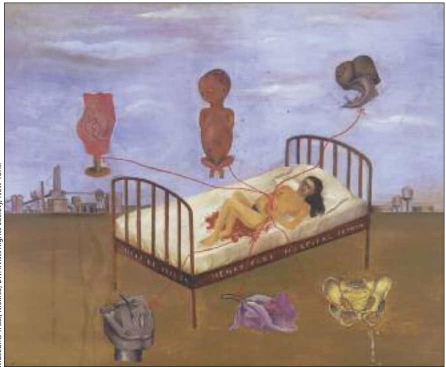
Henry Ford Hospital, 1932, by Frida Kahlo (1907–1954). Oil on metal, 31 x 38.5 cm.

Fans of the two artists have the rare opportunity to see 80 of their paintings. Usually, we are lucky to get two or three at a time. That fact alone makes this show a triumph, even though the exhibition theme seems rather forced. It tries to link the two artists' work to their joint commitment to revolutionary politics and pride in