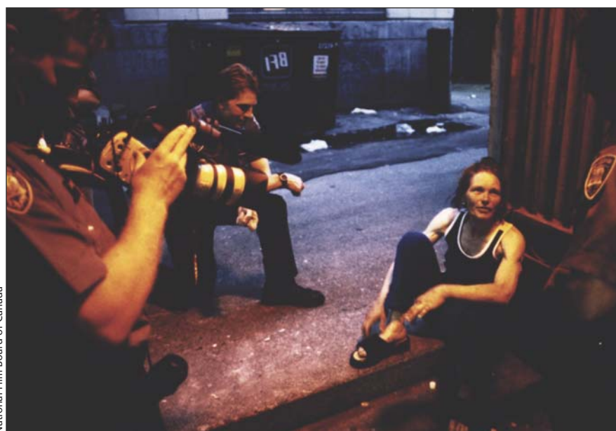
A scene from Through a Blue Lens (1999), which documents life in Vancouver’s Downtown Eastside.