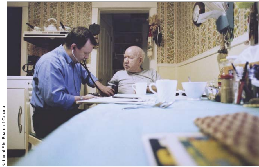
National Film Board of Canada