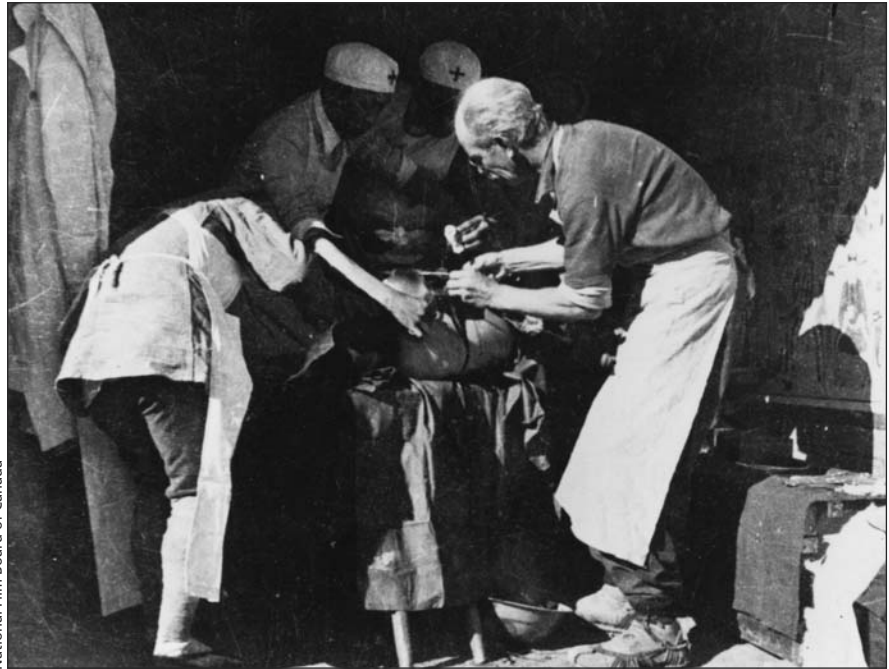
National Film Board of Canada

In the 1920s, Bethune develops tuberculosis and insists on undergoing a risky pneumothoracic procedure. These early personal and professional experiences serve to radicalize him. “There is a rich man’s tuberculosis and a poor man’s tuberculosis,” he observes. “The rich man gets better, the poor man dies.” During the Depression, he joins the Communist Party and advocates for socialized medicine, but is again distracted by events in Europe. In 1936, he travels to Spain to fight against fascism, an ideology he imagines as a disease of sorts. (His friend, the poet and political activist, Frank Scott, sees Bethune’s revolutionary zeal as deriving from the same impulse that drives the surgeon, namely, the desire to cut away the bad for the sake of the whole.)