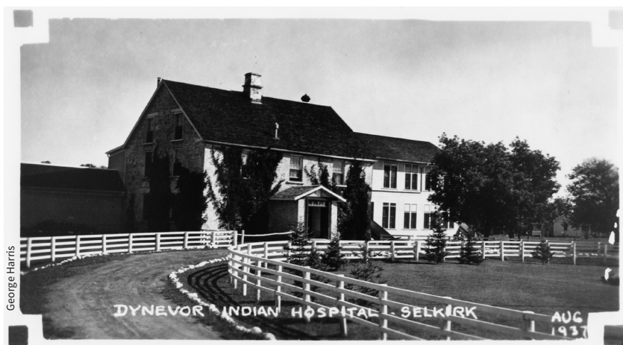
Figure 1: Dynevor Indian Hospital photographed in 1937 (Photo used with permission of the Manitoba Archives).

Conditions did not improve throughout this time or afterward — an observation supported by Dynevor records that showed students with TB being transferred directly from the 4 identified schools to the hospital between 1930