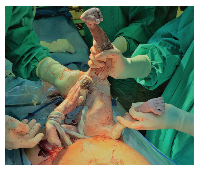
Figure 3: A fetus (35 + 5 wk gestation), delivered by cesarean, with a nuchal cord and limb entanglement; the umbilical cord was tightly wrapped 4 times around the infant's ankle and once around the infant's neck.