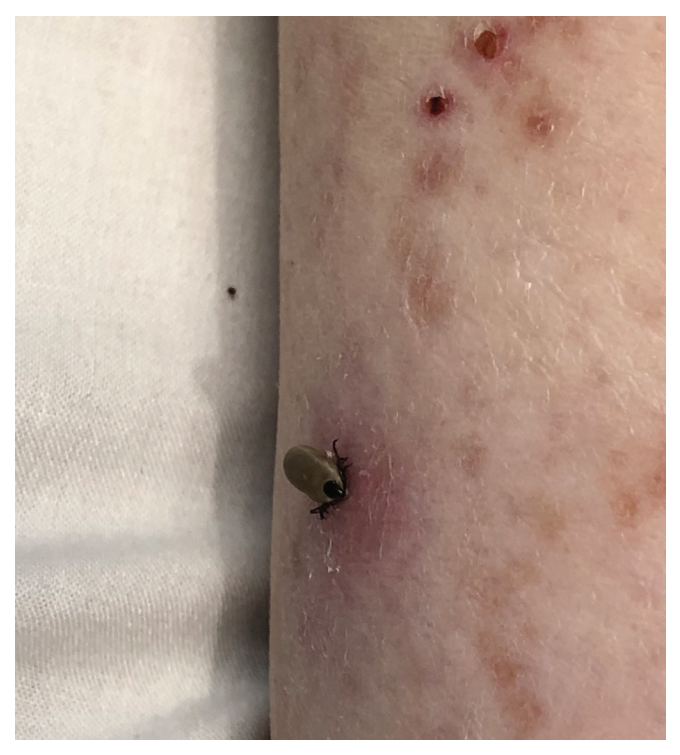
Figure 1: Ixodes scapularis tick attached to the left calf of a 74-year-old man with human granulocytic anaplasmosis with secondary hemophagocytic lymphohistiocytosis.