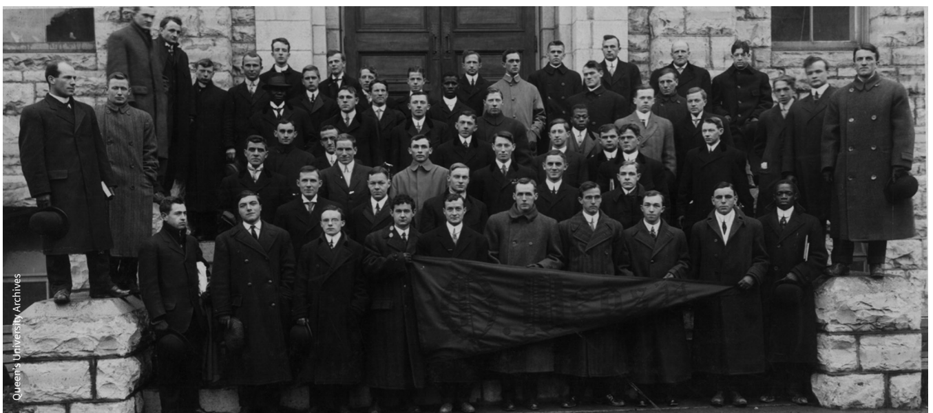
Figure 1: The graduating class of the Queen’s Faculty of Medicine on the steps of Jackson Hall in 1914. This cohort was one of the last to include Black students before the school’s ban on Black medical students in 1918.