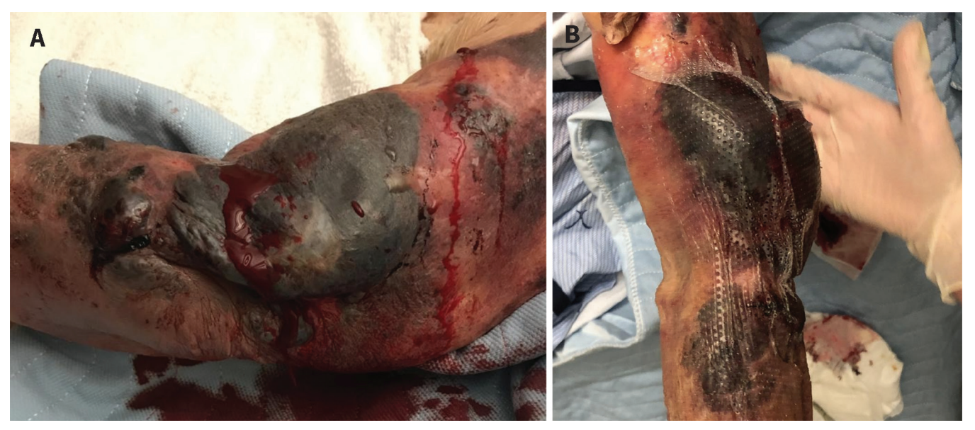
Figure 1: Photographs of bullous hemorrhagic dermatosis lesions on the left arm and hand of a 90-year-old woman, on day 6 (A) and day 10 (B) of fondaparinux administration.