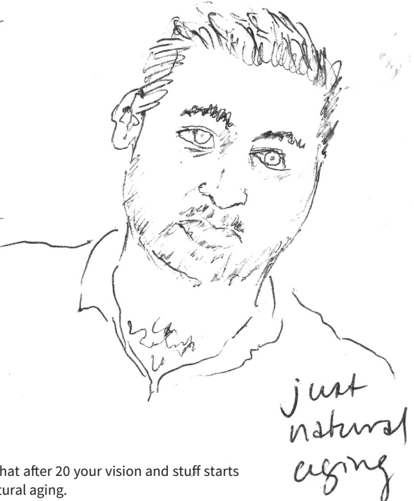
You agree with me that after 20 your vision and stuff starts to go down. Just natural aging.

you agree with me that after 20 your vision & stuff starts to go down