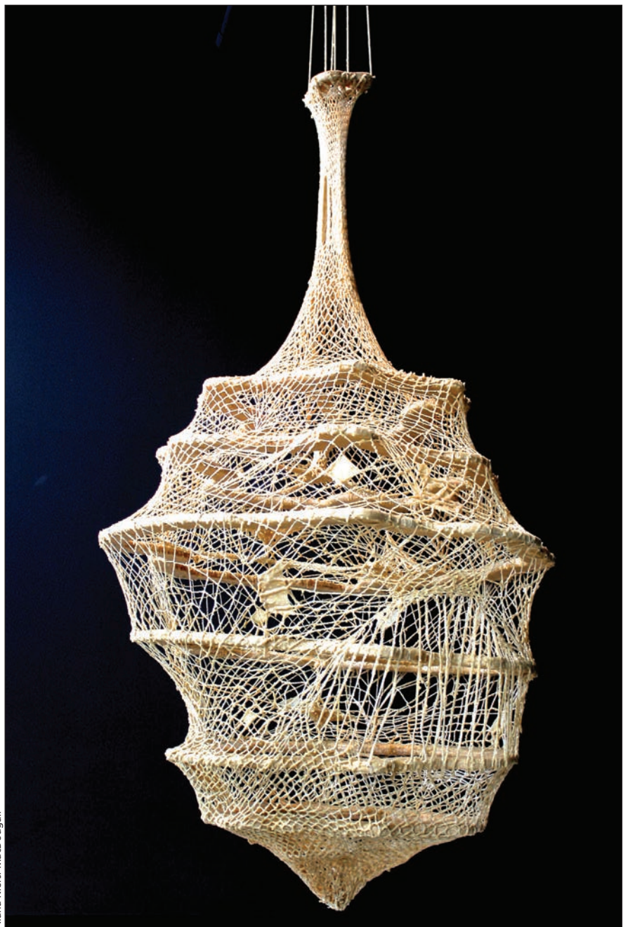
Alana Kiersi MacDougall

"Mass," 2013, by Alana Kiersi MacDougall. Wood, cotton string and beeswax, 3' x 4' x 6'.