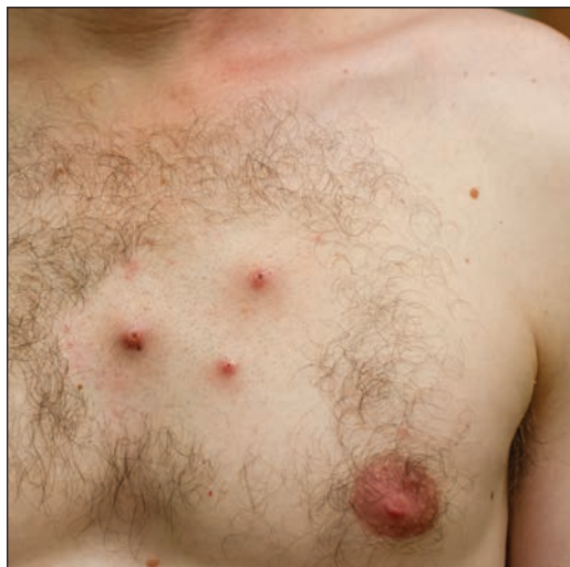
Figure 2: Myiasis caused by Dermatobia hominis in a 33-year-old man. Three domiciles were noted on the patient's anterior chest wall after he returned from Belize.

hospital. His sharp, stabbing pains returned later that night, arising from the three nodules from which the larvae had been removed. By applying petroleum jelly occlusion and lateral pressure at home, the patient was able to extract a fourth larva from the chest wall two weeks later, and a fifth dead larva after three additional weeks (Figure 3). A presumed sixth larval nodule was identified on the patient's anterior chest (Figure 3),