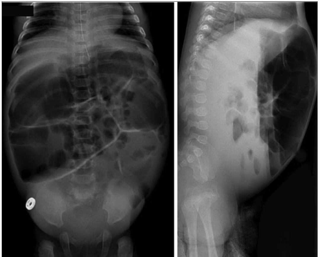
Figure 2: Abdominal radiographs taken at 3 months of age showing severe bowel distension with multiple air-fluid levels in the small bowel. Severity of symptoms was such that the patient received a rectal biopsy for suspected Hirschsprung disease.

Genomic DNA samples isolated from whole blood were used in PCR amplifications that were performed employing oligonucleotide primers flanking the variant of interest in the SI gene. Polymerase chain reaction was carried out in 30- \mu L mixtures containing 32 pmol of each primer (sequences available in Appendix 1, available at www.cmaj.ca/lookup/suppl/doi:10.1503/cmaj.140657/-/DC1 ), 0.2 mM each of