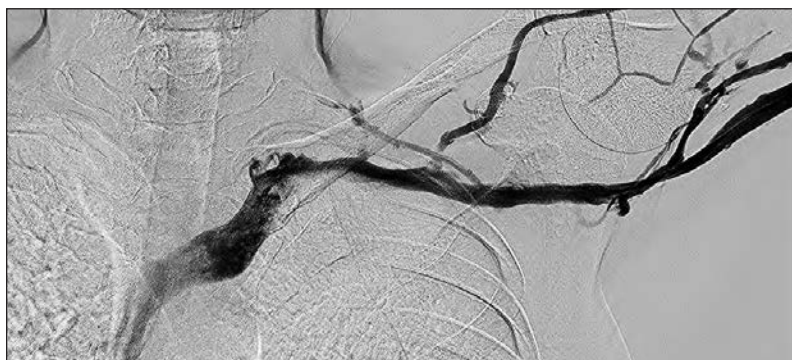
Figure 3: Venogram 1 month after resection of the first rib on the left side, showing a widely patent subclavian vein with the upper extremity abducted to 120 degrees.