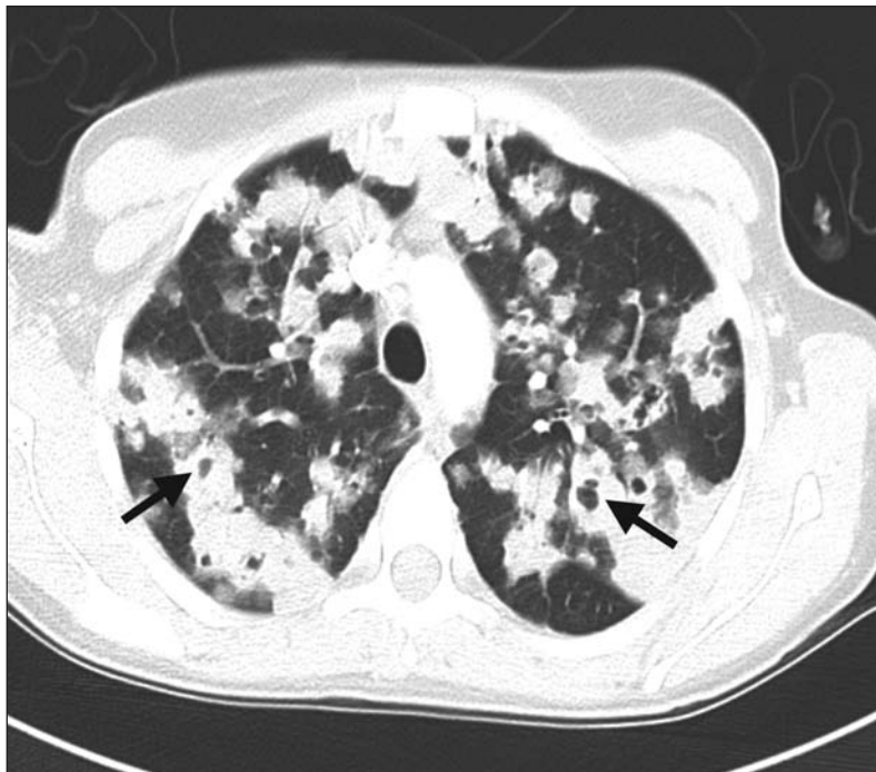
Figure 2: Enhanced computed tomography scan of the patient's chest at presentation. Bilateral parenchymal infiltrates with areas of cavitation are prominent in the upper lobes of the lungs (arrows).

MacDougall and colleagues propose that off-island cases of C. gattii infection may be due to fungal elements being carried across the Strait of Georgia from Vancouver Island to the mainland via airborne or anthropogenic dispersal. 6 However, no infections with the VGIIa strain of C. gattii have been shown to be acquired in Calgary, and the distance between Vancouver Island and Calgary (> 1000 km, separated by the Rocky and Coast Mountains) makes local acquisition in the case of our patient unlikely.