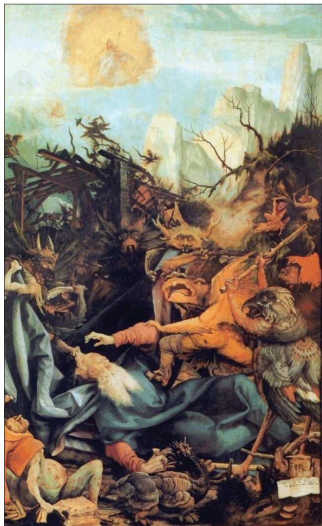
Figure 3: Image from the Isenheim Altarpiece by Grünewald, Musée d'Unterlinden, Colmar, France. This depiction shows St. Anthony (at centre of the image) fighting the demons and protecting a man suffering from "Holy Fire" (left lower part of the image).