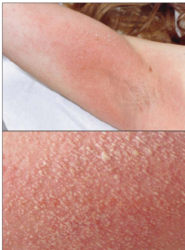
Figure 2: Typical pustular rash in acute generalized exanthematous pustulosis.

Severe drug-induced skin reactions are a major diagnostic challenge. Stevens–Johnson syndrome and toxic epidermal necrolysis are well-described entities. (Stevens–Johnson syndrome is considered a mild form of toxic epidermal necrolysis.) However, acute generalized exanthematous pustulosis is an uncommon drug-related eruption that also warrants recognition. In the literature, it has different names, such as toxic pustuloderma, pustular drug rash and pustular psoriasiform eruption with leukocytosis. The EuroSCAR study group recently reported an annual incidence of 1–5 cases per 1 million people. 1 The