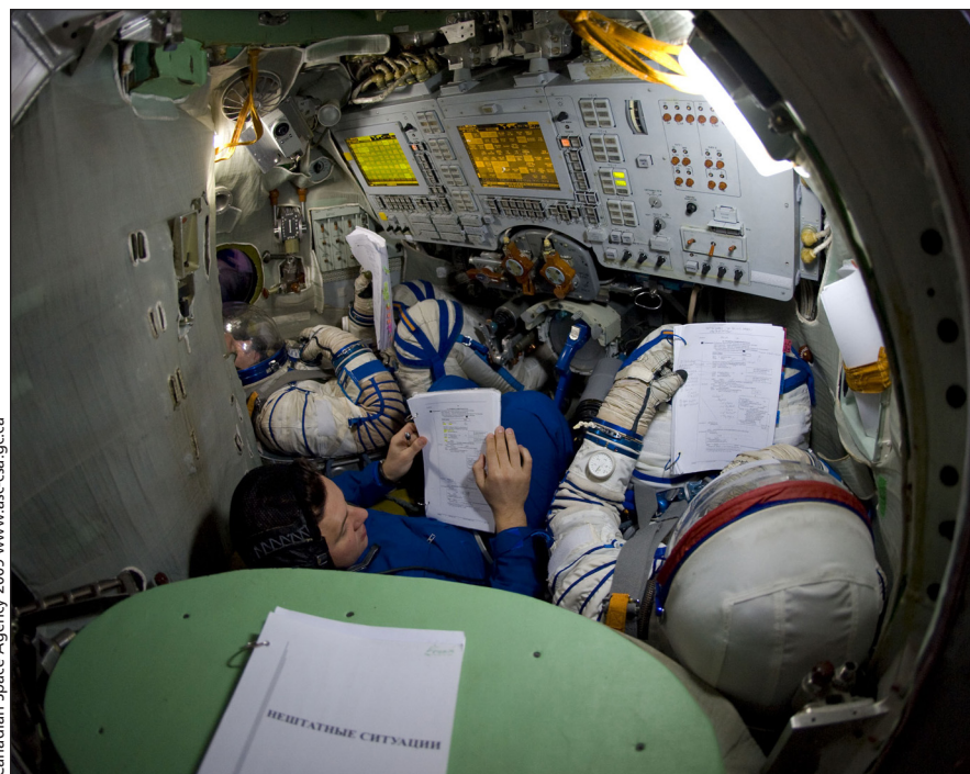
Dr. Robert Thirsk training in a Soyuz Capsule simulator.

CMAJ invites contributions to “Dispatches from the medical front,” in which physicians and other health care providers offer eyewitness glimpses of medical frontiers, whether defined by location or intervention. Submissions, which must run a maximum 700 words, should be forwarded to: wayne.kondro@cmaj.ca.