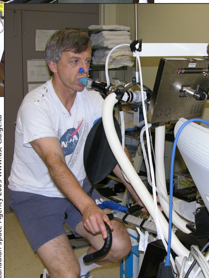
Dr. Robert Thirsk training for Expedition 20/21.

Medical operations in weightlessness can be counterintuitive. For instance, protocols for cardiopulmonary resusci-