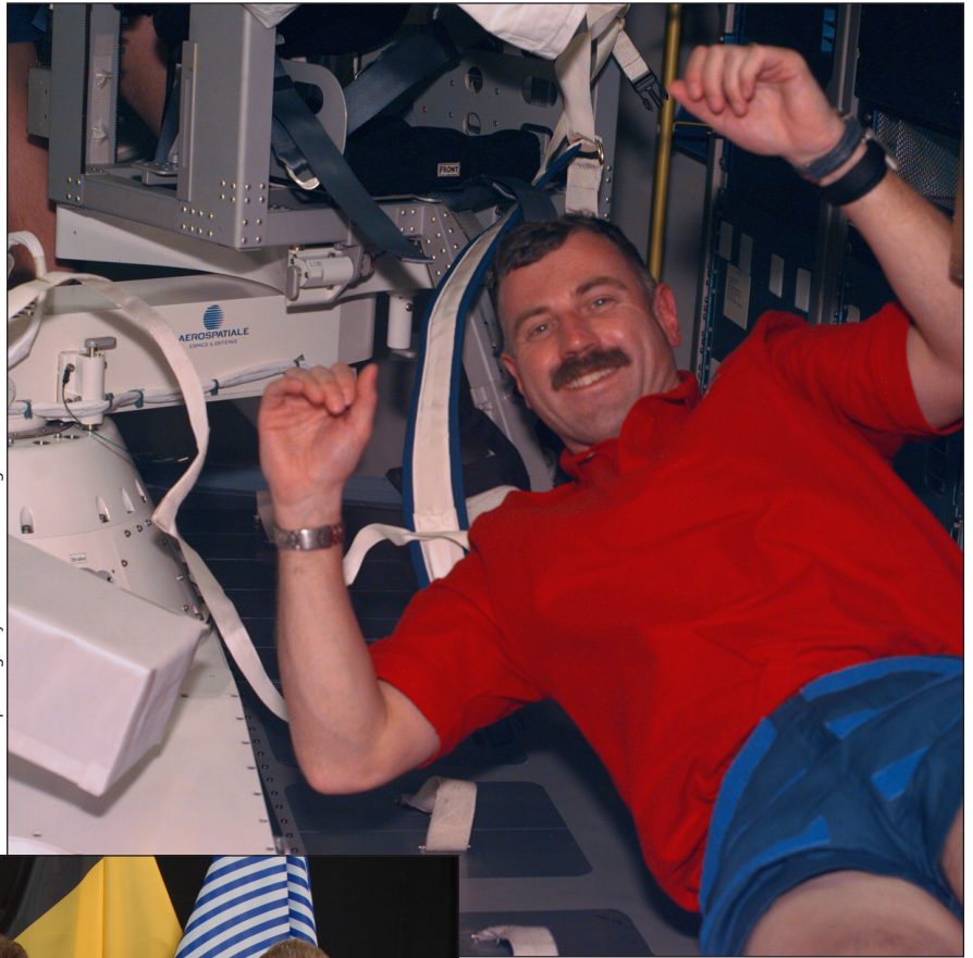
Canadian Space Agency 2009 www.asc-csa.gc.ca

But adaptation to space flight is not easy. Since we are earthlings, it takes time for our bodies to adapt to this new environment. Some physiologic systems, such as the cardiovascular and neurovestibular systems, adapt quickly. For instance, we experience a headward shift of blood and extravascular fluid soon after arriving in orbit, which results in “puffy faces,” distended jugular veins, headaches and persistent nasal congestion.