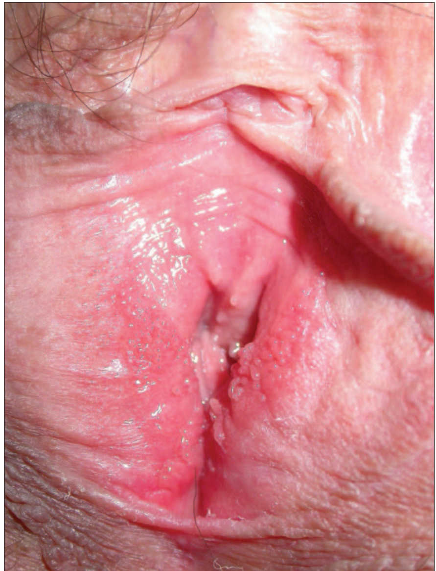
Figure 1: Multiple symmetrical papules on the labia minora of a 24-year-old woman. The papules, present for at least 2 years, had not changed in number or size and were asymptomatic.

CMAJ invites submissions to “What is your call?” Clinical details (including images) are presented on the first page along with a multiple-choice question about the diagnosis. The answer and a brief discussion of the condition follow on the second page. We specifically invite submissions illustrating common or important radiographic and electrocardiographic diagnoses of appeal to a general audience. We allow up to 5 references and require authors to obtain consent from the patient for publication of his or her story (form available at www.cmaj.ca/authors/checklist.shtml ). Submit manuscripts online at http://mc.manuscriptcentral.com/cmaj .