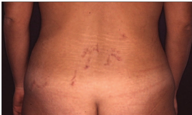
Figure 1: Pruritic, erythematous and serpiginous eruption on the lower back of a 28-year-old woman.