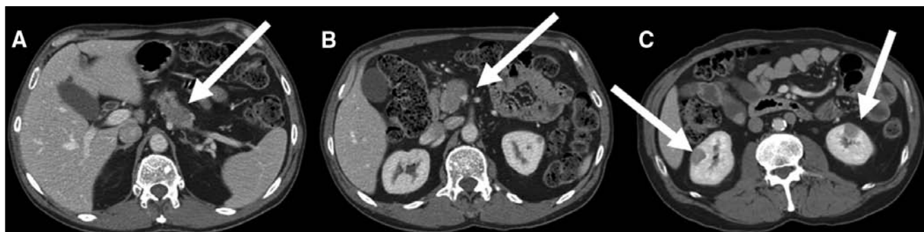
Fig. 1: A: Bulky, heterogenous mass in pancreatic head (arrow). B: Narrowing and pinching of superior mesenteric vein (arrow). C: Bilateral renal lesions (arrows) appearing as well-circumscribed masses mimicking tumours.