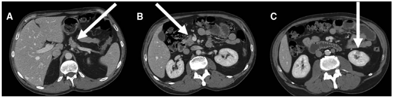
Fig. 4: A: Resolution of swelling of mass in pancreatic head after treatment (arrow). B: Mass is released from the superior mesenteric vein, revealing a visible plane (arrow). C: Complete resolution of lesions in right kidney after treatment (arrow), with significant decrease of lesions in left kidney.

rhea. On radiographic imaging, a mass in the head of the pancreas is the most common finding in both disorders.