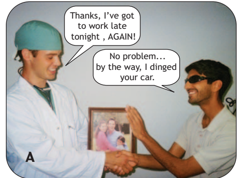
Dr. Philips knows his family will get the attention they deserve with Steve from the Pseudo-Doc Program™.

Cardiac surgeons work long hours, often at the expense of spending quality time with their families — so much so that they soon become strangers in their own homes. If this sounds like you, don't "flat line" just yet, because we have the solution for you! Yes, the Pseudo-Doc Program™ by MDs 'R' Us® allows you to rent a highly trained, certified professional who will take over your duties at home while you're working late in the OR. They'll pick up your kids from school, take them to soccer practice, and have those once-in-a-lifetime, heart-to-heart parent-to-child talks that your children need. For an additional fee, they'll also run errands for your spouse and take them out for romantic dinners. And no need to worry — our people hold to a strict "No Palpation" policy! With Pseudo-Doc Program™ by MDs 'R' Us®, you can have your CABG and eat it too! Now only $24.95/hour!