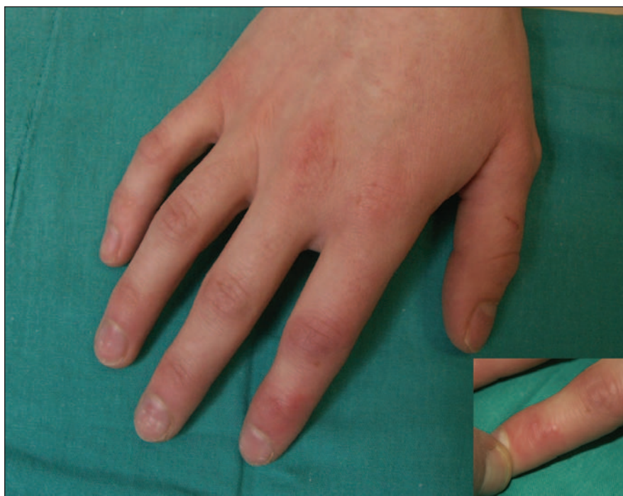
Fig. 2: Two different images of a single lesion.

Storage devices, such as a hard drive (with > 50 Gb of memory) and a CD-ROM burner, allow you to store and archive older images.