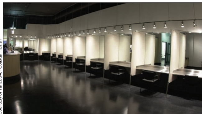
Fig. 1: Vancouver's medically supervised safer injecting facility.

Although the best strategy for evaluating the safer injecting facility would be to randomly assign IDUs to either full access or no access to the program, interventional study designs for the evaluation of such facilities have been deemed unethical; 15 thus, the evaluation of the Vancouver facility was structured primarily around prospective cohort studies involving IDUs who used the facility and those who did not. In accordance with the Transparent Reporting of Evaluations with Nonrandomized Designs (TREND) criteria for observational research, 16 a detailed description of the evaluation