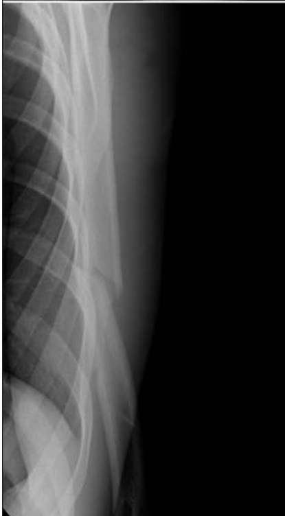
Frontal (top) and lateral (bottom) digital radiographs of the left humerus of a 20-year-old, left-handed man who had sudden arm pain after throwing a dodgeball.