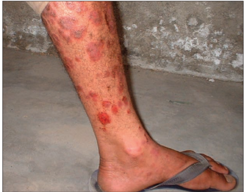
A 32-year-old man with diffuse, well demarcated, raised, erythematous scaly plaques. Removal of the plaques often led to pinpoint capillary bleeding.