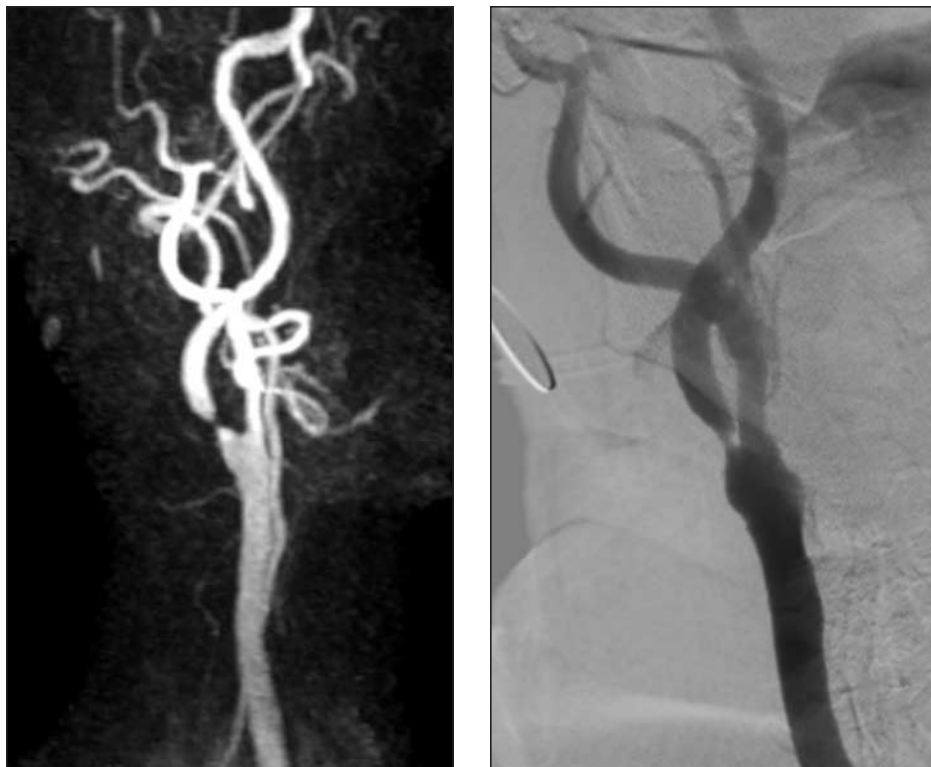
Fig. 2: Left: Contrast-enhanced magnetic resonance angiogram of the right carotid artery showing a tight stenosis (> 70%) of the right internal carotid artery just distal to the bifurcation. Right: Formal selective cerebral angiogram showing the same lesion. The patient had had a TIA and was enrolled in a clinical trial in which he received carotid angioplasty and stenting to treat his symptomatic carotid stenosis.

Published clinical trials of antiplatelet agents, cholesterol-lowering agents or antihypertensive agents have generally grouped all stroke types and TIA mechanisms together. However, some TIAs may be caused by microhemorrhages rather than ischemia, which implies a significant risk of intracerebral hemorrhage rather than ischemic stroke. 21,22 Other TIAs may be caused by embolism from an aortic arch plaque. It is logical to believe that both acute and preventive treatments can and should be tailored to the underlying mechanism implicated. Current technology using ultrasonography and CT and MR imaging permits rapid acquisition of neurovascular information to determine the mechanism. Focused trials or trials large enough to analyze subgroups by TIA mechanism are now needed to address the role of various therapies by particular stroke type and mechanism. A study is underway to investigate