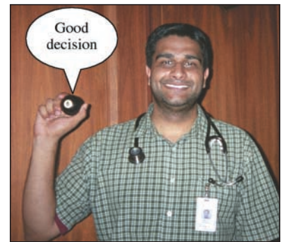
"You are on fire today!"

Family physicians often work with little or no back-up, so it can be hard for them to get the second opinion they need or the kudos they so richly deserve. Now, their troubles are over. The patented Consult 2000™ can help alleviate the stress your loved one faces because of a shortage of specialty support. This device resembles a handsome novelty eight ball and it offers such helpful and insightful comments as: "Go with you gut!", "Great job, Doc!", "Remember not to overmedicate!" and "You made the right choice!". Order before Dec. 1 and have an extra personal message, "You are on fire today!", added at no extra charge. Just $199.99.