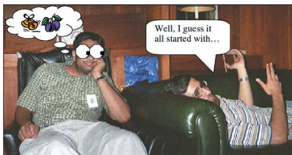
The Bore-Me-Not™ shades for psychiatrists come in several styles and colours.

No one spends as much time talking to patients as psychiatrists. But let's face it — sometimes the conversation is less than stimulating. Get a real Freudian slip on these patients with these handy Bore-Me-Not™ shades. Available in a wide assortment of colours and styles, they can get any psychiatrist through those long days feeling well rested and rejuvenated. Reduced to $19.99.