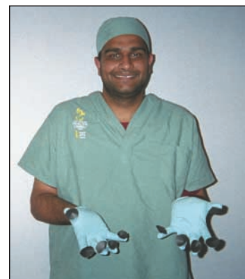
The birth of a new idea! Drop-Stop™ obstetrics gloves.

Babies are slippery and difficult to hold when born. That's why we have developed our new Drop-Stop™ obstetrics gloves — the perfect gift for the busy obstetrician. Made of a space-age adhesive polymer developed by NASA, we've adapted them to fit right over normal surgical gloves! Moreover, they are disposable and biodegradable! Order one box of 100 for $9.99 and we'll send you another box for FREE!