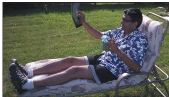
Radiologist At Work!™

With the development of digital technology in radiology, radiologists don't even have to be in the hospital to do their job — the pictures can be emailed right to the lounge chair in their backyard. Now, our creative team has come up with a fun line of beachwear and accessories for the sun-loving imaging expert. Choose from stylish shorts and Hawaiian print shirts in a wide array of colours. And to ensure that the relaxing radiologist is not disturbed, every order over $50 comes with a fun "Radiologist At Work" sign! Shirts and shorts, $24.99 each.