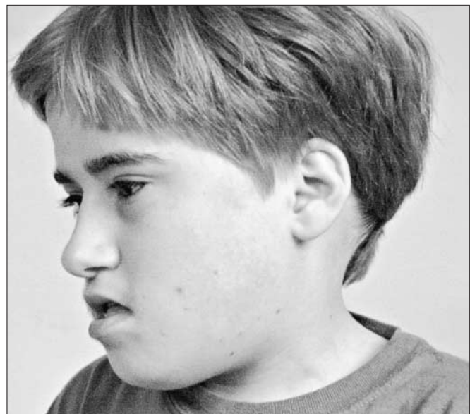
Fig. 2: Partial lateral photograph of patient 2 showing the underdeveloped malar region, the philtrum running parallel to the nose and an everted lower lip, which are all characteristic of Smith-Magenis syndrome.

The eating history, bifrontal narrowness and small mouth raise the possibility of Prader-Willi syndrome, but the height, head circumference and hand size are against the diagnosis. Although Brushfield spots are associated with Down's syndrome, they are common in the general population, there were no other findings of Down's syndrome mentioned and the G-banded karyotype was normal. The clue was the initial karyotype that was reported as being normal, but with a 14p+ variant not found in the parents. True variants tend to be stable and transmitted from a parent. The geneticist ordered a repeat karyotype. The 14p+ was not typical of the usual normal variant; whole chromosome painting was requested and showed that the large "p" arm of chromosome 14 was caused by translocated material from chromosome 20 (Fig. 1A). Specific subtelomeric probes showed its origin was the short arm of chromosome 20 (20p) (Fig. 1B), and the child was thus trisomic for part of chromosome 20p, which accounted for his mild dysmorphic signs and moderate developmental delay. The parents were relieved to finally have an explanation and the extended family was informed that other family members were not at risk of having similarly affected children.