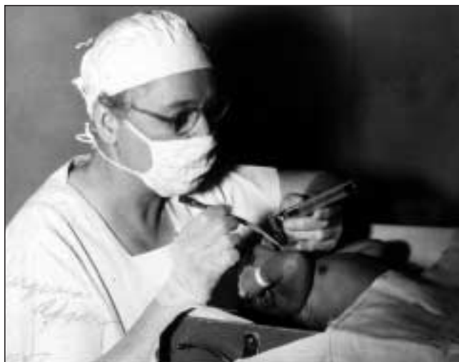
Virginia Apgar (1909-1974)

Medical student University of Calgary Calgary, Alta.