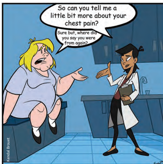
Figure 2: Where are you REALLY from? Concept by Renata Leong.