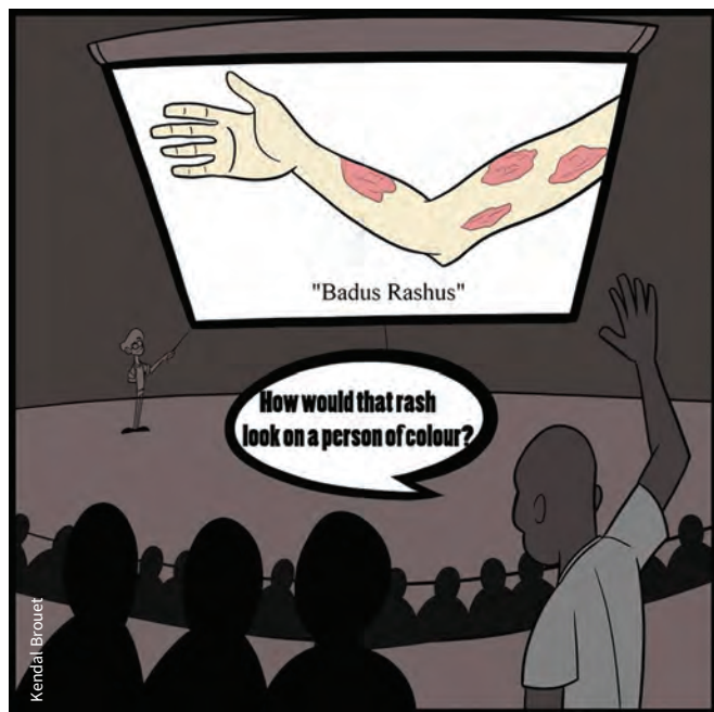
Figure 3: Badus Rashus . Concept by Sivaruben Kalaichandran.