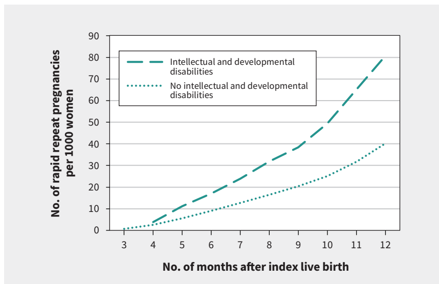
Figure 1: Cumulative incidence of rapid repeat pregnancy occurring within 12 months of a prior live birth, among women with (thick dashed line) and without (dotted line) intellectual and developmental disabilities. To avoid misclassification of complications from the index live birth as a rapid repeat pregnancy, rapid repeat pregnancies were counted starting at 3 months after the index live birth. Because of the small number of events among women with intellectual and developmental disabilities, the data for 3 and 4 months are combined, to protect individuals' privacy.

Other variables independently associated with rapid repeat pregnancy were age younger than 25 years (adjusted RR 2.75, 95% CI 2.69–2.82), multiparity (adjusted RR 1.22, 95% CI 1.19–1.26), urban residence (adjusted RR 1.35, 95% CI 1.30–1.40), low neighbourhood income (adjusted RR 1.46, 95% CI 1.43–1.49), receipt of social assistance (adjusted RR 1.71, 95% CI 1.65–1.77), mental illness or substance use disorder (adjusted RR 1.13, 95% CI 1.11–1.16), and infrequent use or low continuity of primary care (adjusted RR 1.16, 95% CI 1.14–1.19) (Table 2). Appendix 5 (available at www.cmaj.ca/lookup/suppl/doi:10.1503/cmaj.170932/-/DC1 ) shows the individual impacts of covariables on the unadjusted association between disability status and rapid repeat pregnancy. In all models, receipt of social assistance had the greatest impact, followed by age younger than 25 years and low neighbourhood income.