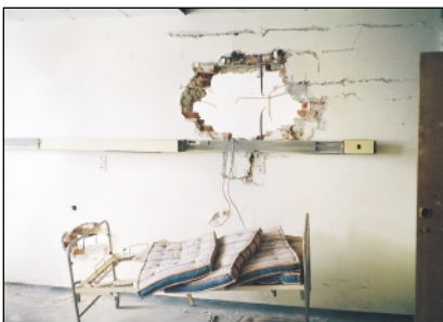
A shell hole provides ventilation in this Bosnian clinic