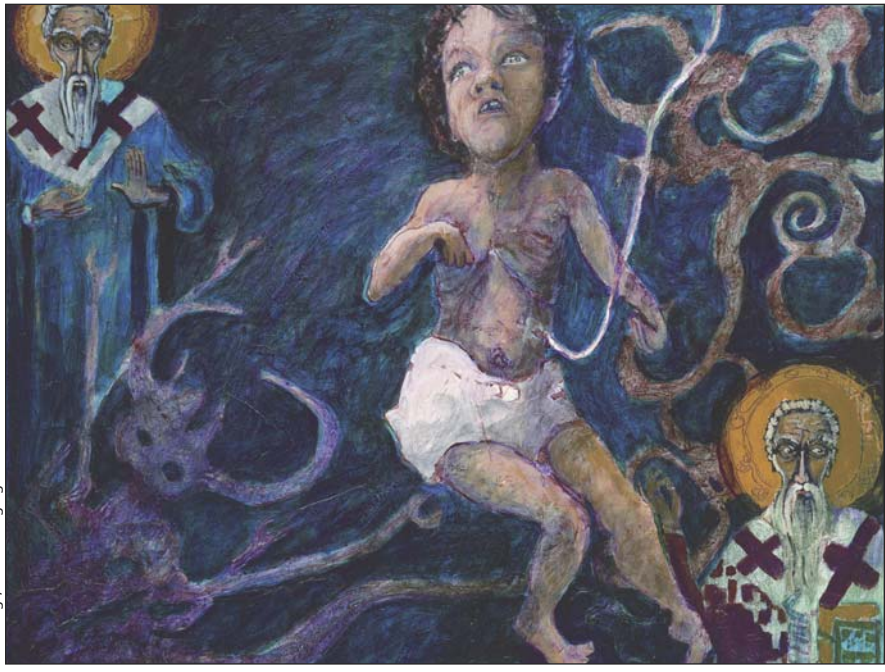
David A. Haughton. "Partial Chromosome Deletion," Kindertotentanz, Series VI (2000). Acrylic on hardboard. 50.8 \times 61 cm. Artist's collection.

children and for what the parents go through."