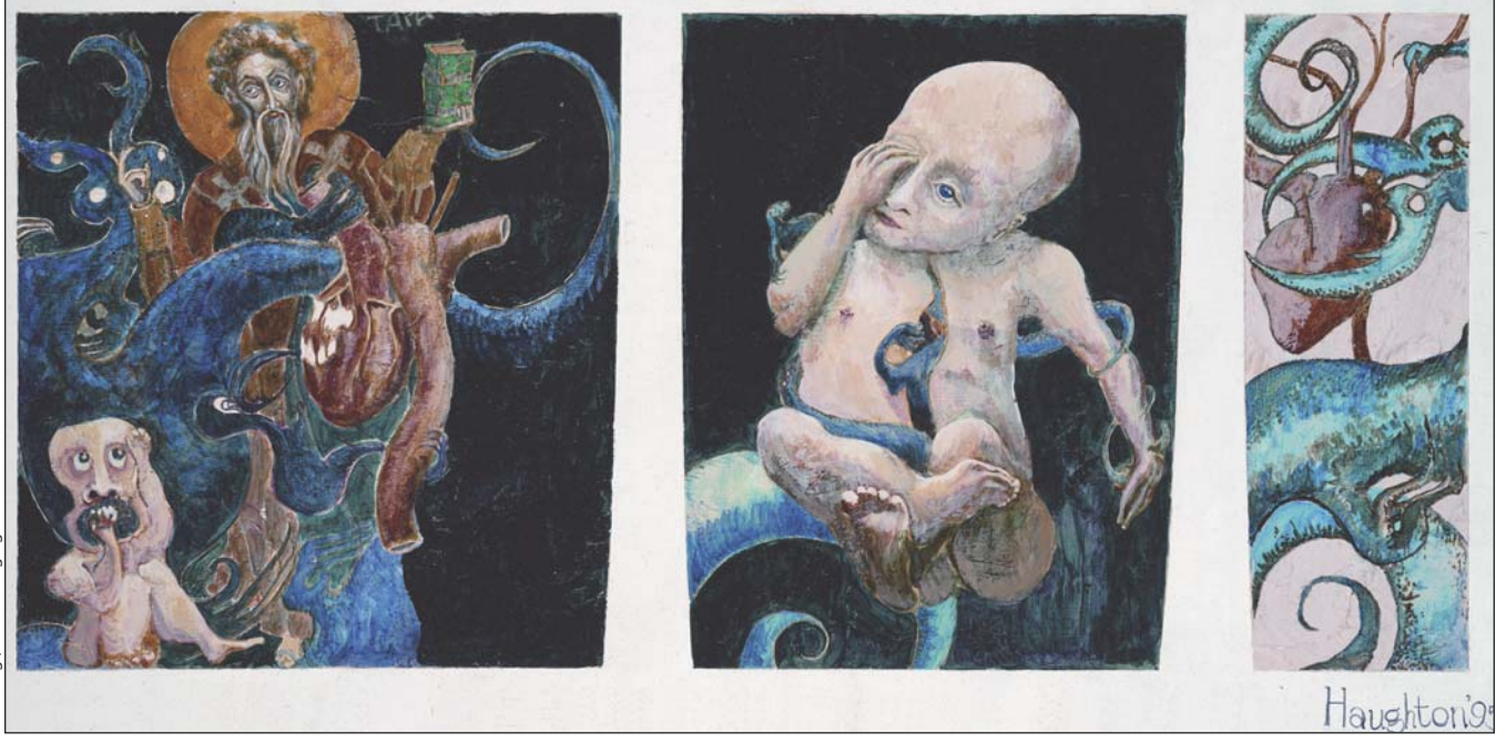
David A. Haughton. "Congenital Heart Disease" (1996). Acrylic on hardboard. 30.5 \times 61 cm. Courtesy of the American Visionary Art Museum, Baltimore, Maryland.

More of Haughton's art can be viewed at www.haughton-art.ca/