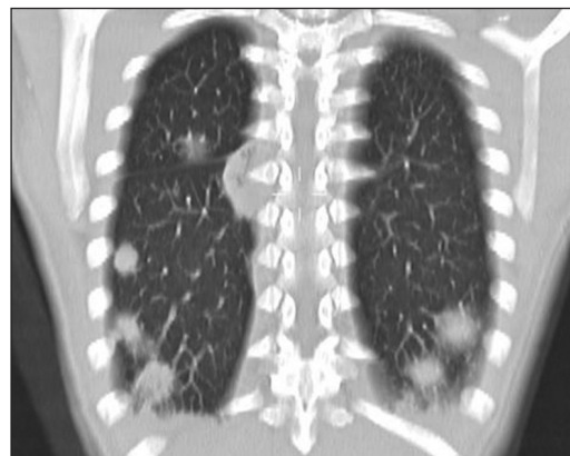
Figure 2: Computed tomographic image of the thorax showing multiple septic pulmonary emboli.