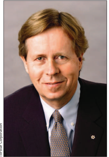
Toronto Star Corporation

In some countries, the escalating cost of medical liability insurance to defend against lawsuits has been the impetus for reforms, which often focus on legal and administrative change. In