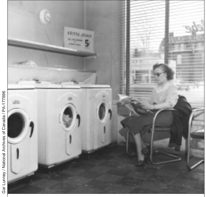
Woman reading a magazine in a laundromat, from the National Film Board filmstrip "Women at Home," 1952

Favourite place: in the car, alone, while parked and waiting for my wife to complete an errand. *