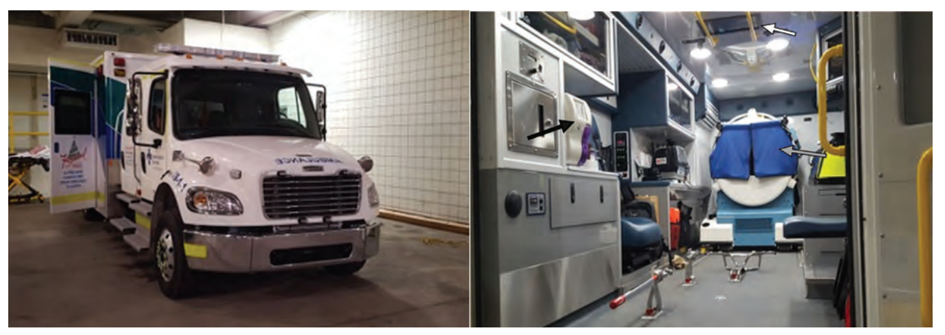
Figure 1: The mobile stroke unit based at the University of Alberta Hospital in Edmonton (left photo). The ambulance (right photo) is equipped with a computed tomography scanner (grey arrow), "point-of care" laboratory (analyzer model pocH-100 i , Sysmex Canada; black arrow) and telemedicine equipment (white arrow).

Telemedicine and transfer of CT images require the availability of fast wireless Internet; poor wireless connectivity may be