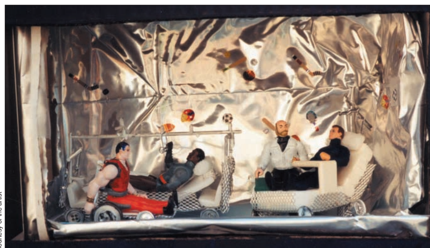
Peter Lojewski, 1996. Modern Hospital (detail). Styrofoam, aluminum, various materials, found objects. Acrylic 20" × 33" × 18".

acrylic paintings from his sketches. In Code Blue , a doctor, a resident and several nurses stand around the bed of an older man. His belly is distended and his chest is sunken. Lojewski paints himself into the centre of the image, performing cardiopulmonary resuscita-